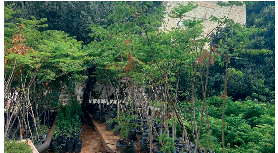
Inside the Nablus Boulevard Site