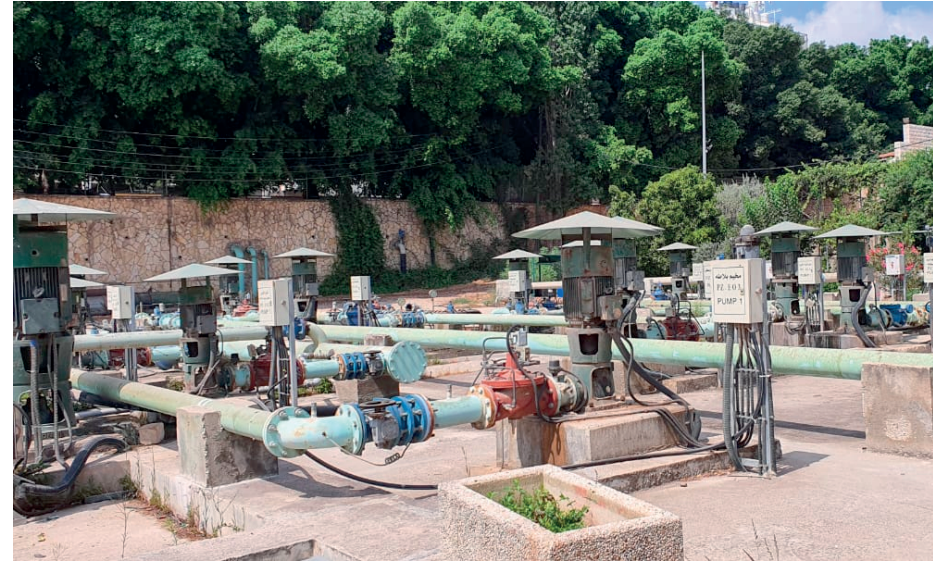
Inside the Nablus Boulevard Site