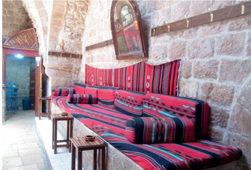
Khaled Bin Al Walid and Al Jame' Al Kabeer Streets