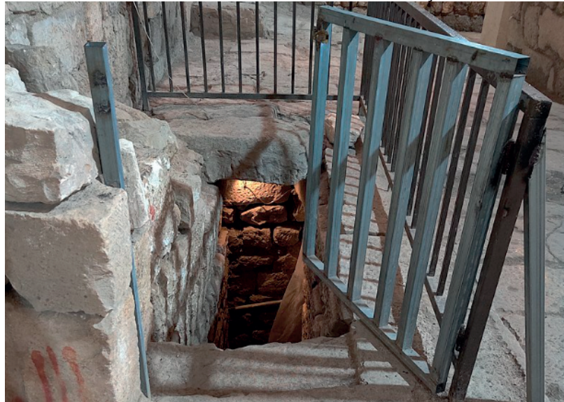
Zafir Al-Masri School