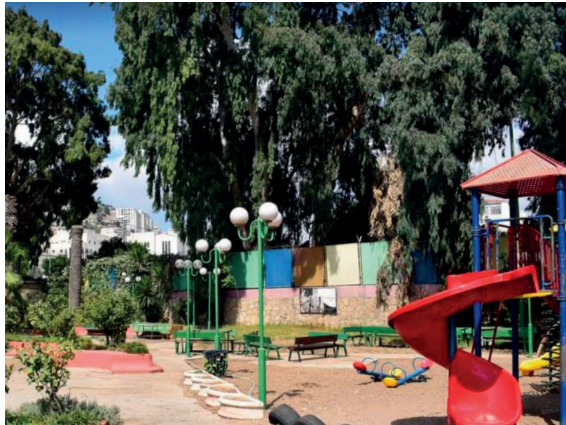
Al Shahid Mtawaa Street