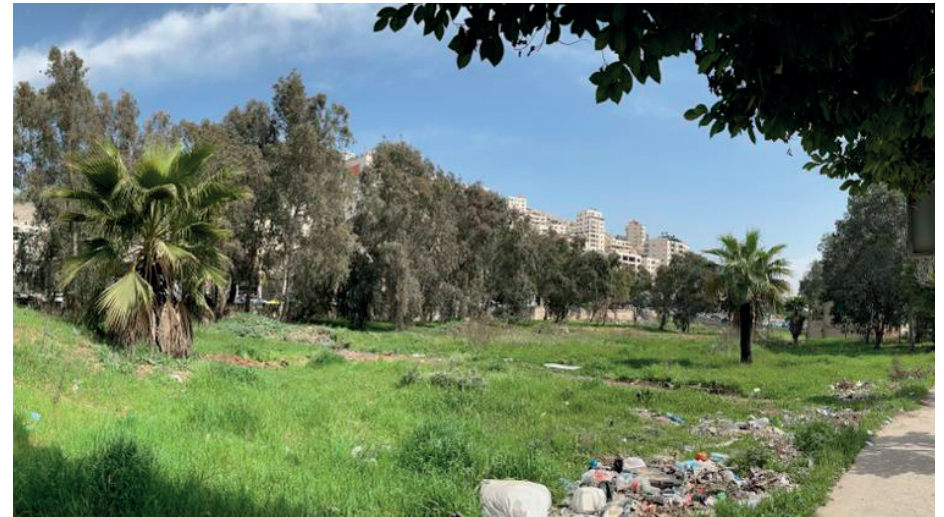
Inside the Nablus Boulevard Site