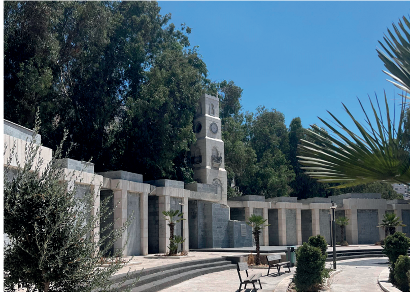
Al Shahid Mtawaa Street