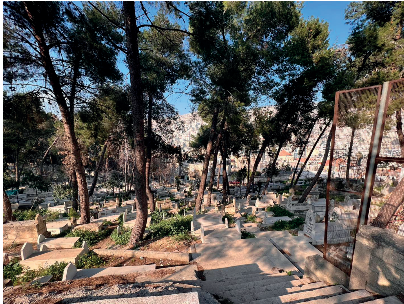
Ras Al Ain Street

③ By the old city. The design of the old city is built around a narrow network of alleys, small streets, squares and bridges.