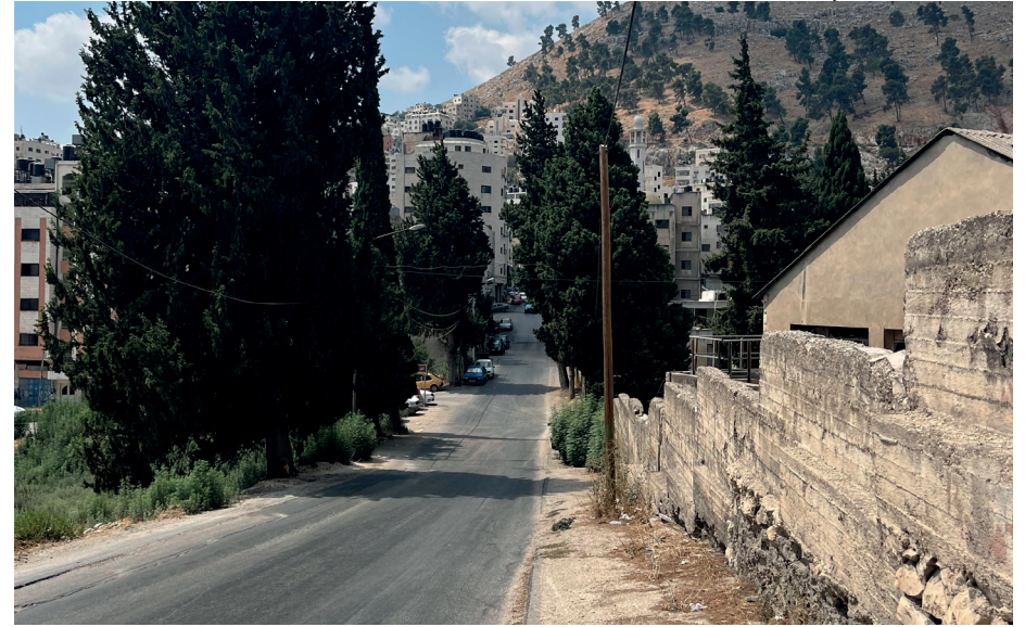
Electricity Station Street