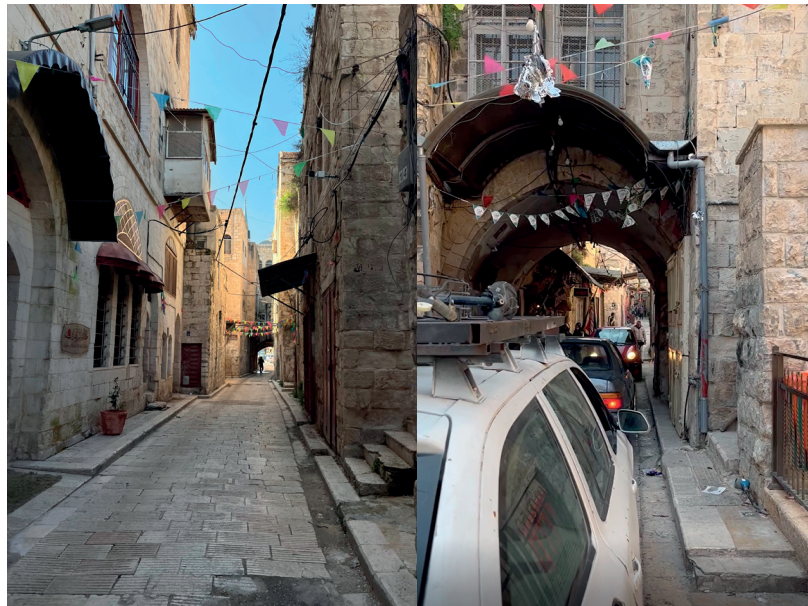
Al Jame' Al Kabeer Street