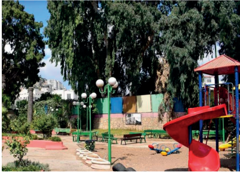
Al Shahid Mtawaa Street