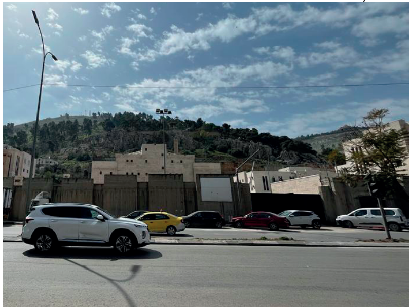
Al Shahid Mtawaa and Electricity Streets