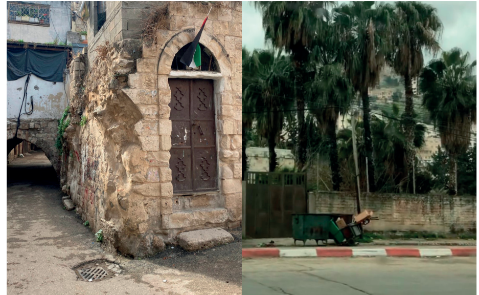
Salah Al Deen Street