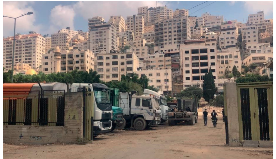
Inside the Nablus Boulevard Site