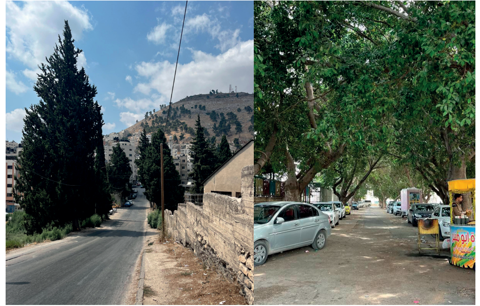
Electricity Station Street