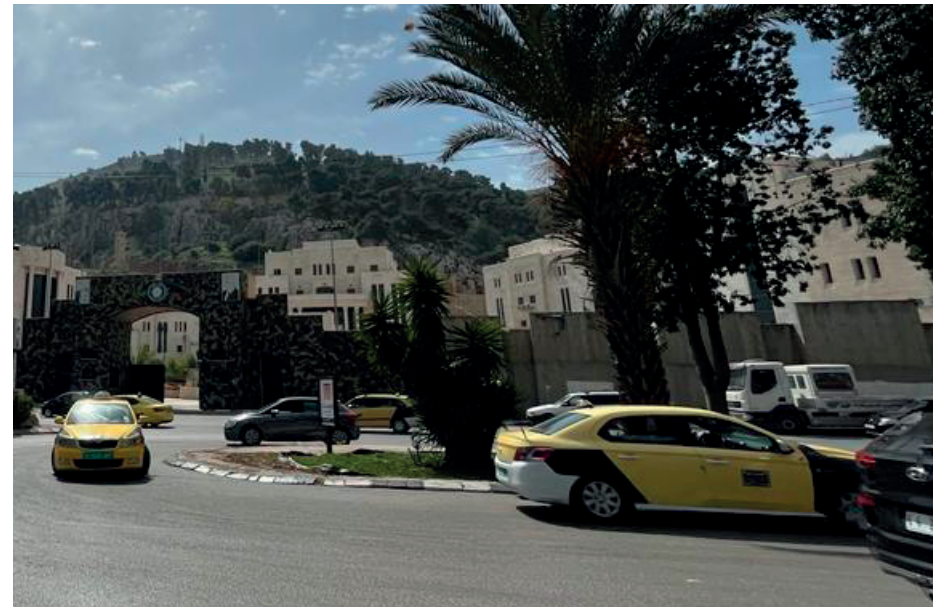
Al Gazalah Street