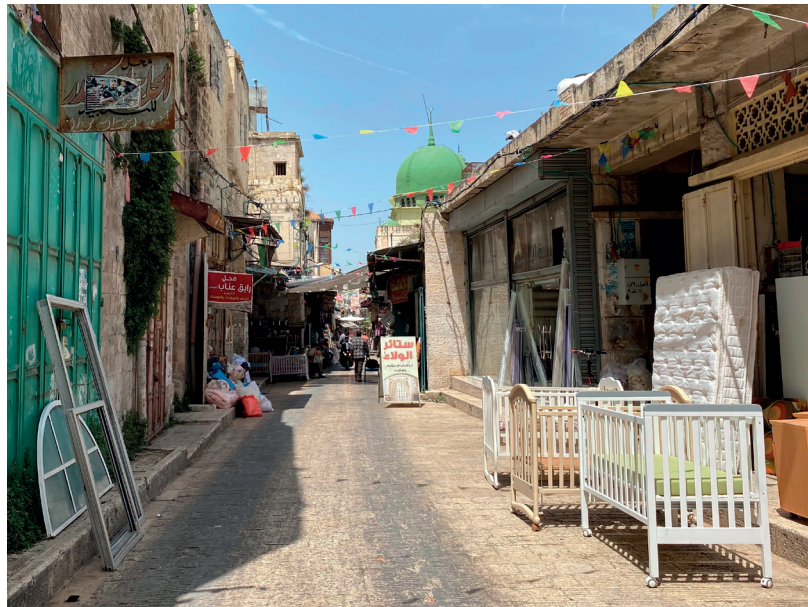
Khaled Bin Al Walid Street

② The soap industry is widespread due to the abundance of olive oil. The existence of Turkish baths in the Old City added to the sustainability of this industry, and, as a matter of fact, the increasing demand for soap was associated with public baths in general.