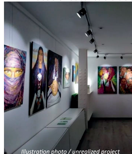
Inside the Nablus Boulevard Site