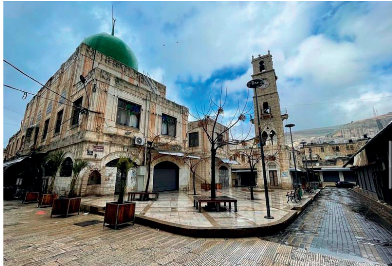
Khaled Bin Al Walid Street