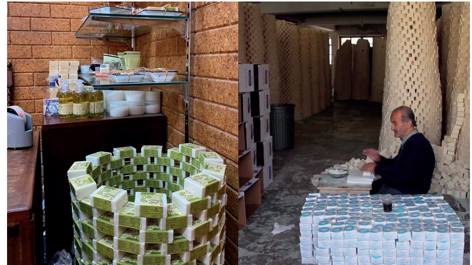
Khaled Bin Al Walid Street

③ Food shops : Nablus is well known for a special sweet called kunafeh . There are dozens of stores for making and selling kunafeh in the city. The Old City is also known for other sweets, especially dough balls soaked in syrup called zalabye , among others.