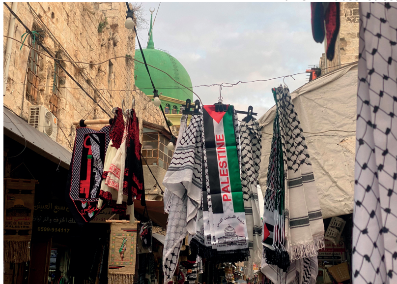
Al Jame' Al Kabeer Street