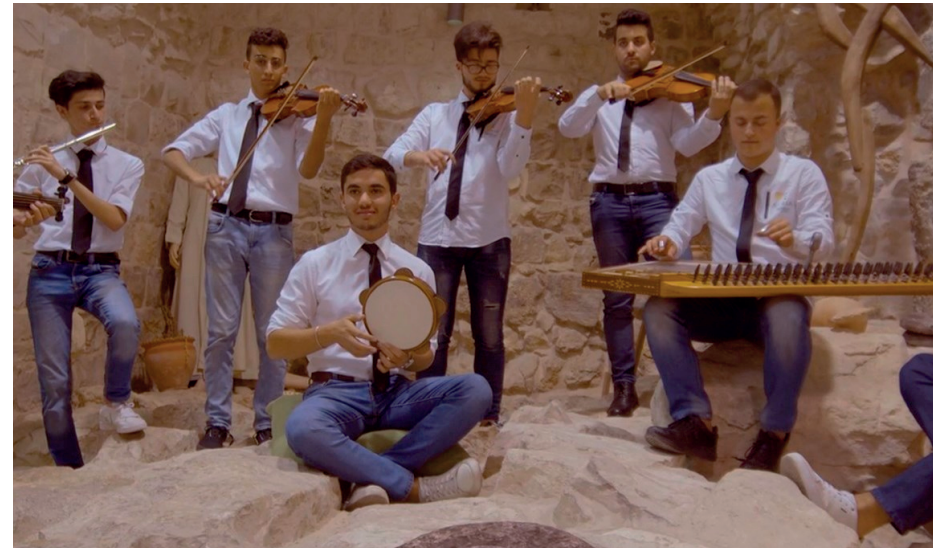
Al Sa'adeh Street