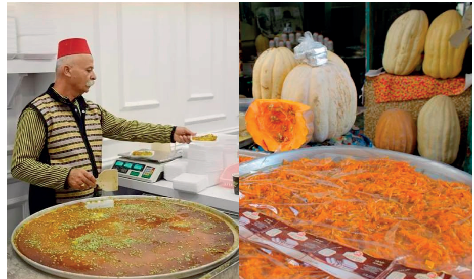
Khaled Bin Al Walid Street

③ Food shops : Nablus is well known for a special sweet called kunafeh . There are dozens of stores for making and selling kunafeh in the city. The Old City is also known for other sweets, especially dough balls soaked in syrup called zalabye , among others.