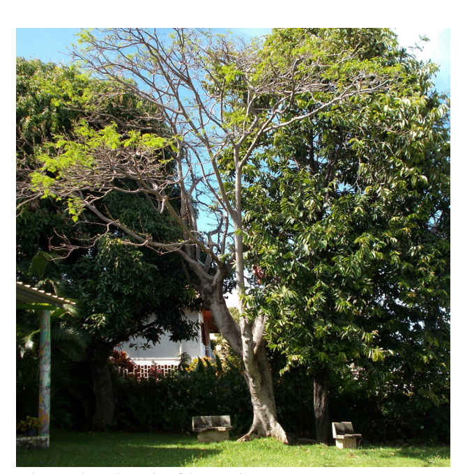
Velvet apple to the right of the Royal poincian

A slow-growing member of the ebony family, its brownblack hardwood is prized by woodworkers.