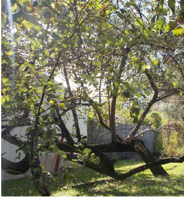
A nearly horizontal Ziziphus behind the Maison Des Associations