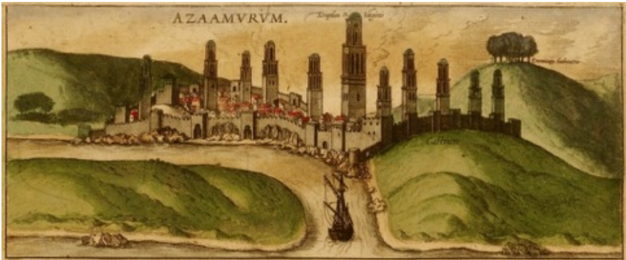
Figure 10. Azaamarum (Azemmour) in the early 16th century, in Braun G., Hogenberg F., Novellanus S. (1572), Civitates Orbis Terrarum I, Koln: Apud Philippum Gallceum / Apud Auctores, tome I, fol. 57-57v.

A second Islamic phase reduced the former surface to a rectangle, known today as medina or the historical heart of Azemmour. The collapse of the subsequent Marinid dynasty maritime advancement and the tendency to lose dynamism in its urban centers would have caused the city's downfall; walled but with much smaller dimensions. This new and smaller perimeter was punctuated by several square towers, a typological feature still visible on the western side. Georg Braun's image shows an urban wall interrupted by several towers, and a city in which several minarets of the mosques can be observed (Figure 10). This would represent Azemmour's features shortly before the Portuguese arrival, a rectangle containing approximately the same nine hectares of the current intramural town.