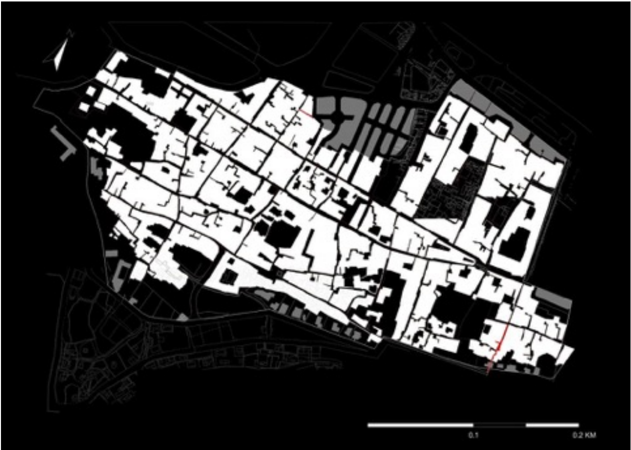
Figure 3. Plan of Nablus' old town. © Correia & Taher

Summing up, Nablus old town urban fabric has been the result of many historical metamorphoses (Figure 3). Besides cultural and/or economic vicissitudes, both natural catastrophes (such as earthquakes), or belligerent conflicts (like the latest 2002 invasion), have had a strong impact on what today is called the old town. Known for its history and tradition, this core neighborhood of an expanding larger city still shows a structured and layered sequence. 15 Today, Nablus can be considered a typical example of an Arabic-Islamic city, in its urban morphology and built environment.