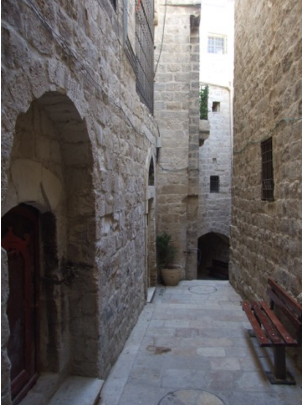
Figure 14. Example of hosh in Nablus's old town.

Like the Qaysariyya quarter in Nablus, the Kasbah/Mellah quarter in Azemmour is the result of a sedimentation process. Here, four and half centuries later, Portuguese traces are faded in a street system that has suppressed several secondary canals. Eventhough the European layout has lasted, like the rest of the Medina quarter the street layout is in accordance to a hierarchical network. From main streets to cul-de-sacs leading to each house, Islamic urban culture is significantly more related to social aspects of private life than to geometrical questions of regularity. Like the hosh for Nablus, the existence of dead end derb shows a tendency to conduct the pedestrian towards less public and more private areas of circulation (Figure 14).