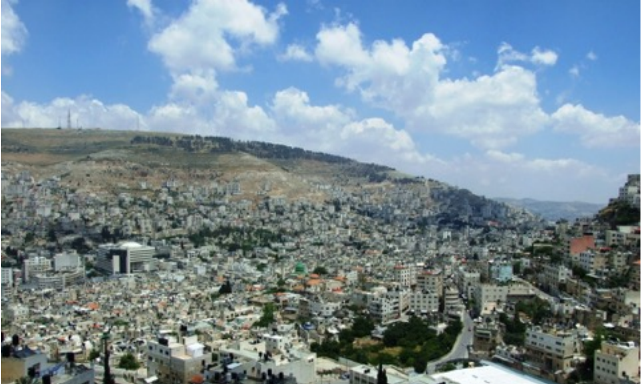
Figure 2. View of central Nablus and its old town quarters.

Nablus is located in the northern part of Palestine. The city lies in a narrow valley between two mountains, making it the most important opening in a mountainous range. 9 (Figure 2) Historically, this position has conferred to Nablus the status of a junction for ancient trade routes: east-west, linking the Jordan valley to the sea coast and Egypt; north-south, connecting Damascus to Jerusalem. 10