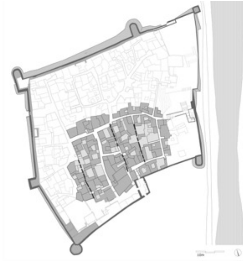
Figure 13. Azemmour: architectural survey of the Kasbah/Mellah quarter with a hypothesis about the Portuguese urban fabric. © Correia & Taher

Through an attentive and accurate survey 23 one can identify a few remaining empty canals amidst houses with similar widths to long shaped occupied lots. These elements indicate traces of former streets, revealing not only how they were obstructed by later structures, but also how parts of that primitive street layout have become cul-de-sacs. By cleaning the plan of such obstacles, it is possible to recover a series of long rectangular shaped blocks. (Figure 13) The two most regular and central blocks show propensity to standard measures around 30 braças for the long side and 10 for the top side, 24 adjusting themselves to the topography.