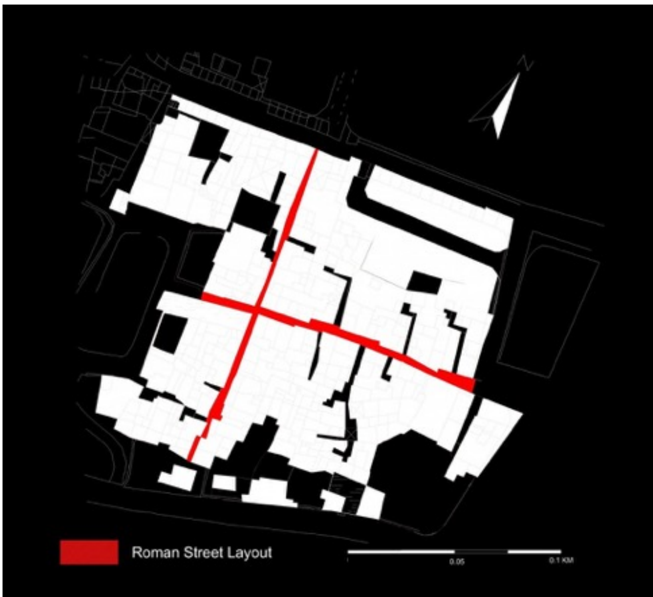
Figure 6. Plan of Qaysariyya quarter in Nablus, showing the Roman street layout.

All the characteristics mentioned before for the general interpretation of Nablus urban morphology apply to Qaysariyya quarter as if it was an optimal sample of the urban transformations the city has passed by. This quarter is considered one of the oldest in Nablus, 16 located in the southeast part of the old town, and it exposes a clear example of the gradual transformation that the Roman urban layout has suffered to suit its Muslim population since the 7th century.