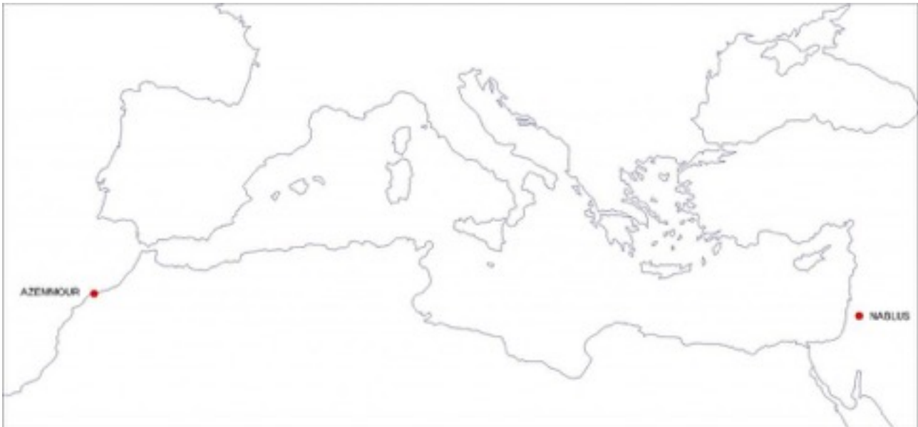
Figure 1. Map of the Mediterranean basin showing the location of Nablus and Azemmour. © Correia & Taher

In order to present the argument in a structured, yet summarized way, two towns will be examined as case studies. Even if they share current circumstances; both being inhabited mainly by Muslim population, Nablus in Palestine and Azemmour in Morocco offer two distinctive realities. Located respectively in the East and West of the Mediterranean basin, their histories witnessed different stages of evolution (Figure 1). Regular geometrical planning inputs differ on chronology, yet the reaction of centuries of Islamic domination presents similar characteristics. Thus, these cities must be understood not only in a physical sense but also in a cultural and social context; in a specifically given time and for a specifically group of given people.