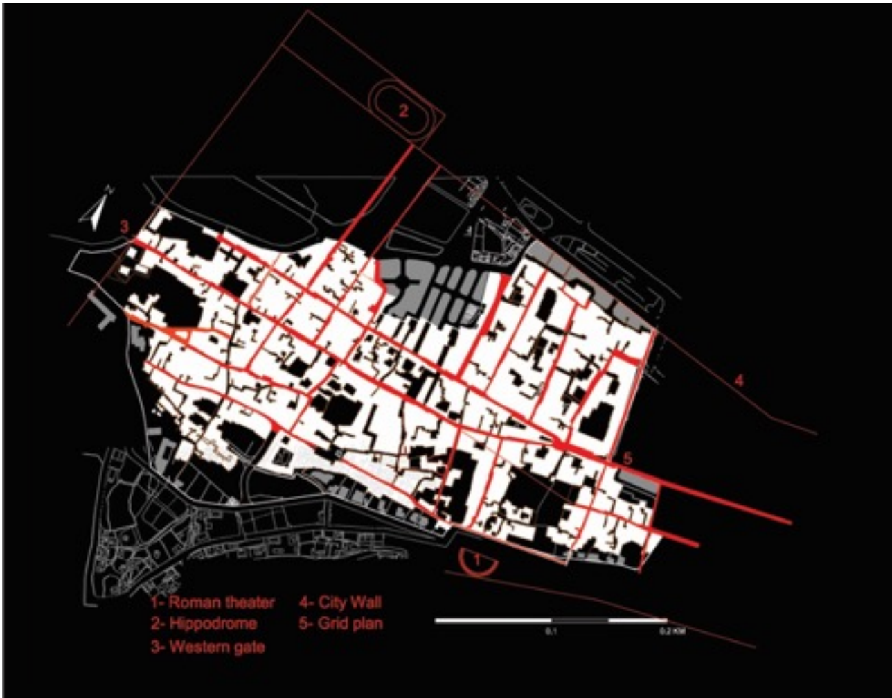
Figure 4. Roman street layout of Flavian Neapolis (Nablus), according to Nablus, Enduring Heritage and Continuing Civilization. 2011. © Correia & Taher

Besides this fact, Nablus street layout is still quite indexed to the Roman period, when it was one of the biggest Roman cities in the region. (Figure 4) Classical linearity can still be read in a street network; owing its matrix to the Roman grid plan. While former Neapolis had been established in a clear east-west linear conception, today Al Jama' Al-Kabeer and Khaled Ibn Al-Walled streets' prevail as unquestionable reminders of the former decumani directions. These were right-angled crossed by secondary streets, the main one being the cardo close to where the great mosque stands nowadays. Some sectors north of the former decumani main streets have kept their geometrical regularity.