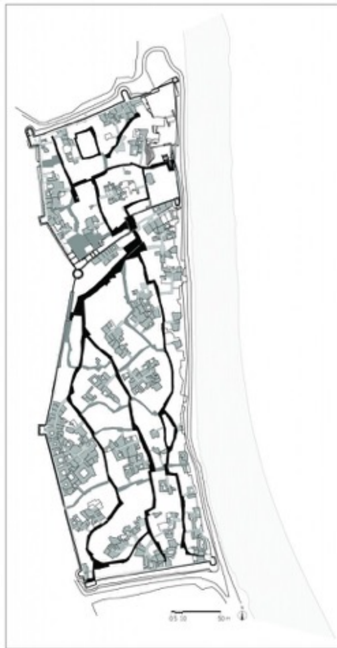
Figure 15. Azemmour: global plan of Kasbah/Mellah and Medina neighborhoods, showing hierarchy of streets and housing clusters only accessible by cul-de-sacs. © Correia & Taher

Essays of mapping households only accessible by these semi-private lanes present a different dimension of the urban fabric. As most of the urban traffic only uses the major thoroughfares ('shar' or tariq), those linking important areas for commercial or religious purposes (eg. market, mosque, gate), there is a side of the town that is just lived by the immediate neighbours of a determined hosh or derb (Figure 15). Built for pedestrian movement, traditional Islamic cities show a gradation from public to private, from halal – what is allowed or profane – to haram – what is forbidden or sacred. 26 These cultural dimensions work as filters at different levels of the urban structure or the building composition. The courtyard represents the private spaces of a house, its domestic haram, and it is the basic spatial unit in the traditional Islamic city. Its regular geometry abandons the supposed disorder of the street. Since the cultural matrix of Islam favours enclosed spaces, courtyards of mosques are therefore the semi-public squares the city rarely possesses.