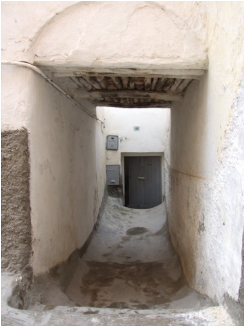
Figure 16. Example of sabat in a derb of Azemmour's medina. © Correia & Taher

As a consequence, streets are sided by many blind facades, symbols of intimacy and privacy, and often consoles hanging from upper storeys. In both case studies, one can still observe the application of rules referring to medieval traditions. The concept of fina' is a key element, an open space surrounding or bordering a certain household whose usage is given to the owner. By other words, the fina' translates into a daily practice of preferable loading, unloading or animal tying and parking by the owner, meaning a virtual extension of the house towards the public space. Therefore, the effective use of fina' contributed to narrowing lanes and interrupting perspectival alignments. The reverse projection of this urban right of usage to the upper floor led to the building of sabat or qantara, meaning superior passages over streets. (Figure 16).