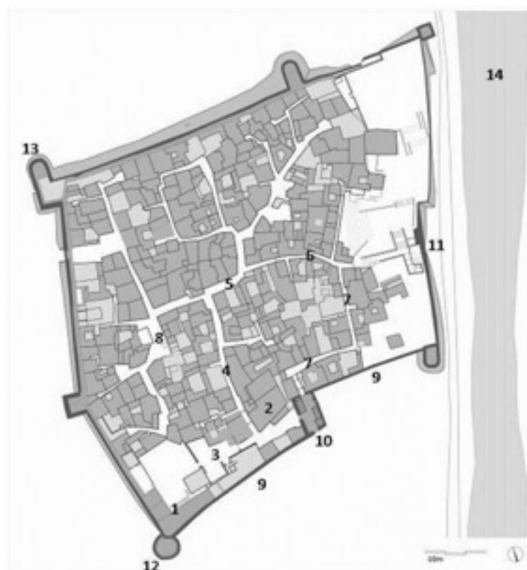
Figure 12. Plan of the Kasbah / Mellah neighborhood in Azemmour, former Portuguese castle/town, 1. Captain's House, 2. Mosque, former Portuguese church, 3. Main square, 4. Derb Touamia (Touamia pathway), 5. Derb Kasbah (the old town pathway), 6. Derb Mellah (the juives' quarter pathway), 7. Derb Souika, 8. Derb Sidi ben Abdallah, 9 'Atalho' wall, 10. Town Gate and Bastion, 11. River Gate, 12. Bastion of São Cristóvão [Saint Christopher], 13. Bastion of Raio [Thunderbolt], 14. River Oum er-Rbia. © Correia & Taher.

During the Portuguese period, the castle/town was organized in two clusters (Figure 12). Uptown, around the town's main yard or square, there was the Captain's House, the main church and the main gate to the exterior. Downtown, near the river entrance, gathered three trade supporting buildings 22 . 'Rua Direita' [main street] connected both clusters, which can still be traced in today's Derb Mellah, part of Derb Kasbah and Derb Touamia streets, and led to a certain regularity of parallel and perpendicular streets. But while this L-shaped axis is still vital for the quarter's circulation, it is more difficult to read the rest of Portuguese former new town plan. Taking into account changes caused by centuries of Islamic presence after 1541, an attentive examination of fabric plots can point other directions.