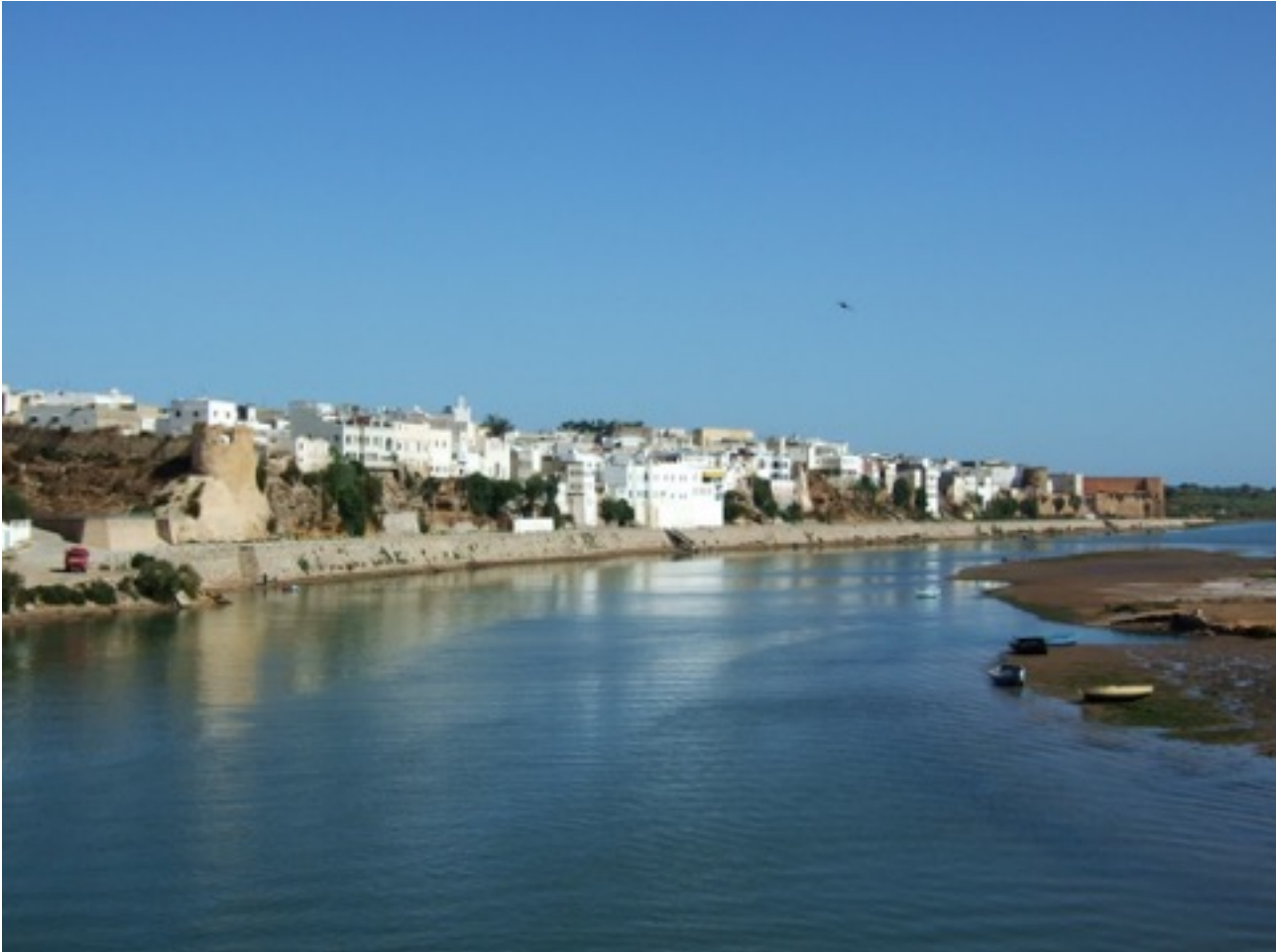
Figure 8. View of Azemmour from the river Oum er-Rbia.

Azemmour is a small town on the mouth of river Oum er-Rbia in Morocco (Figure 8). Its present size doesn't match the magnitude and importance of its past, especially as far as architectural and urban aspects are concerned. The city's urban configuration can be summed up as an Arab-Muslim continuity interrupted by a thin layer, yet extremely relevant: the Portuguese occupation from 1513 to 1541.