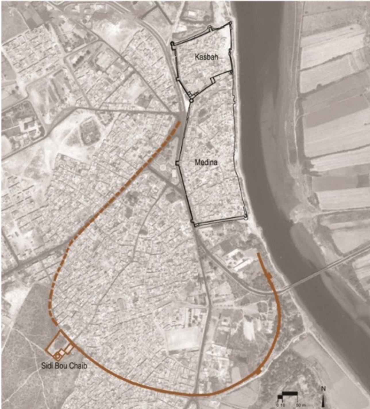
Figure 9. Aerial view/plan of Azemmour, showing current medina walls in black and probable Islamic Medieval perimeter in color (based on Google Earth®).

Azemmour suffered intense processes of urban growth and shortening for nearly one thousand years. Although its origins are unknown, it is certain that the site evolved to become a riverside urban assemblage in the Middle Ages. In its heyday, when the Almohad dynasty dominated northwestern Africa, the city occupied a much larger area than today's precinct. Both aerial views and the survey of the remaining ruins help draw a large round perimeter encircling which, nowadays, is an extended portion of the extramural town, passing by Sidi Bou Chaib mausoleum, a memorial place (Figure 9).