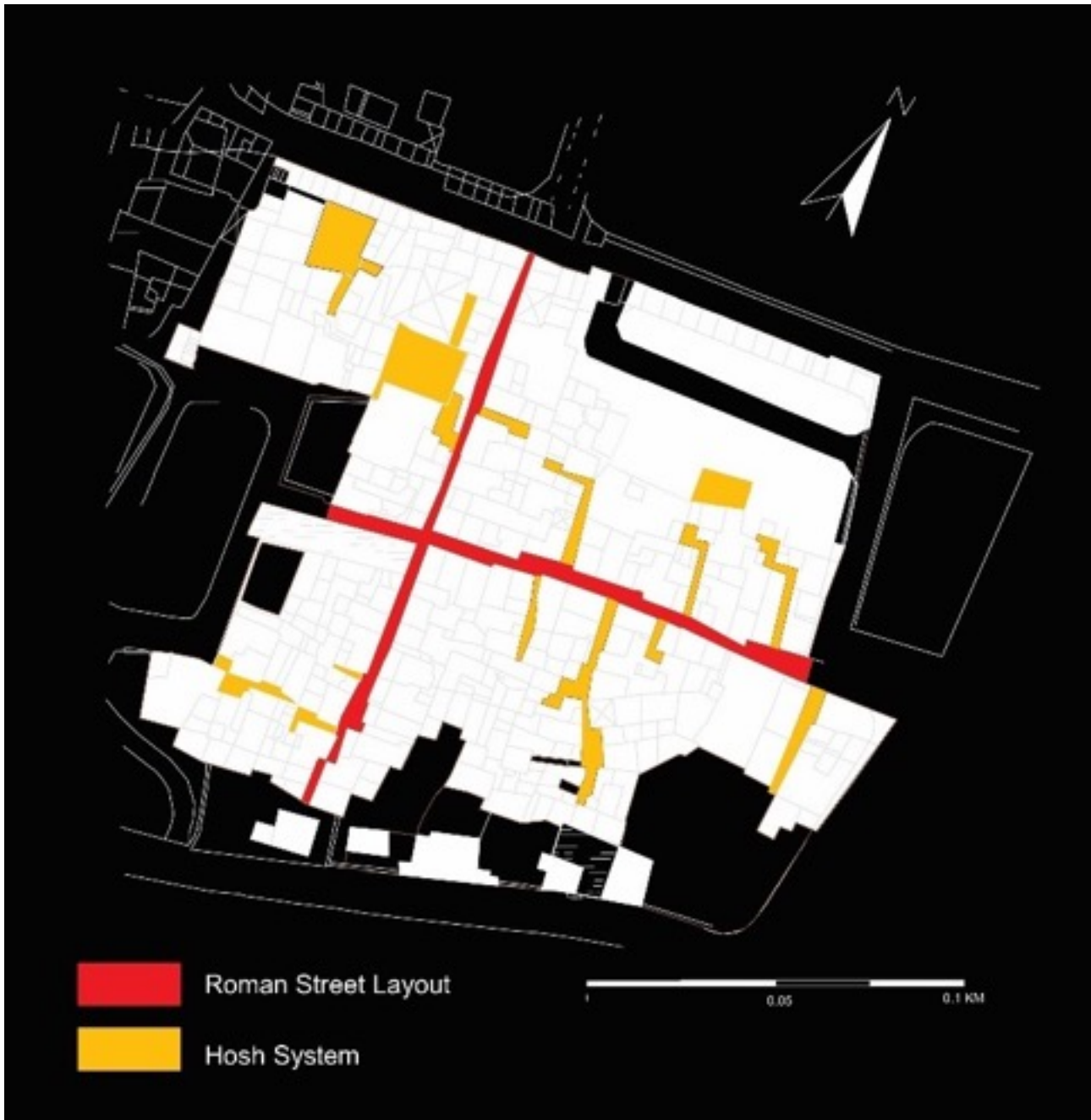
Figure 7. Plan of Qaysariyya quarter in Nablus, showing the hosh system. © Correia & Taher

While the cross remains as the main structure for public circulation within the quarter, connecting it to the rest of the old town, each fourth sector was invaded by a dead end hosh in order to establish a second degree of urban distribution (Figure 7). Catering private houses, act as their extensions or semi-private lanes, shared by neighbours whose houses are accessible only by the very same hosh. In terms of urban design, the result seems confusing to external eyes, but order prevails within this configuration. From the household to the cul-de-sac alley, from this to a quarter's public canal, and through this to the main commercial artery, life is defined by codes of Islamic social conducts, privileging diverse seclusion degrees.